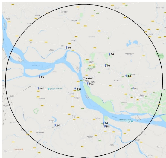
Figure 2. Sampling scheme for groundwaters in the vicinity of the Rooppur NPP.